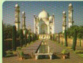
Bibi ka Maqbara